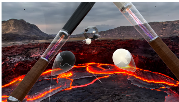
Figure 1. Supernatural Flow game mode.

The Supernatural game has 2 exercise modes: Flow and Boxing. Both modalities cue participants to arm movements with color-coordinated orbs that have directional arrows to indicate movements to participants. There are also horizontal bars and triangles to encourage squatting, lunging, and the dodging of obstacles. During their first session, participants engaged in the workout mode Flow. Flow is an aerobic workout that involves both the upper and lower body and footwork in 360 degrees ( Figure 1 ). Participants wield a virtual bat in each hand, striking targets in a variety of patterns and intensities. Lower-body movements are incorporated into each sequence, requiring participants to squat or lunge to hit some targets. During the second session, participants challenged a Boxing workout. Boxing requires participants to punch, uppercut, or swing through color-coordinated orbs and has horizontal and diagonal bars that participants have to maneuver their head and torso under and around ( Figure 2 ). Note that still captures of Supernatural provide only an approximate impression of the actual, first-person in-app perspective of a Supernatural user on modern Meta Quest hardware.