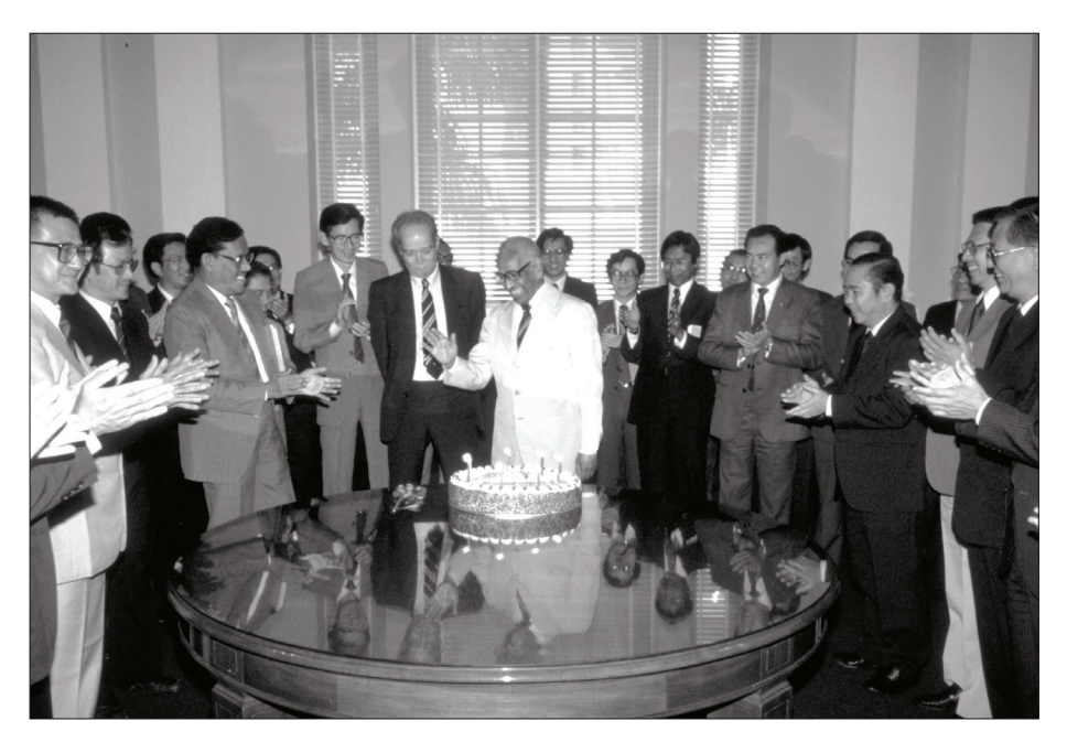
54. Ministers and MPs gather in the Members' Room in Parliament House to celebrate Raja's 70th birthday in February 1985. He is now Senior Minister in the Prime Minister's Office.